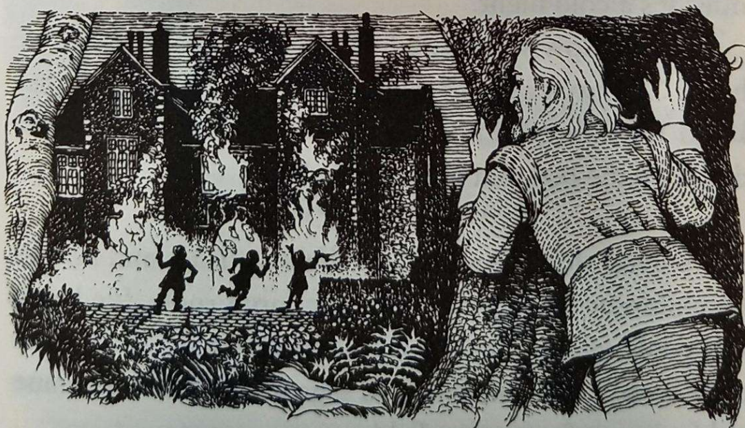
Then Jacob saw flames at the windows. Arnwood was burning!

After a while he heard horses, and the Parliamentary soldiers arrived. Soon they were in the gardens and all round the house. A few minutes later Jacob saw black smoke going up into the sky; then he saw flames at the windows. Arnwood was burning!